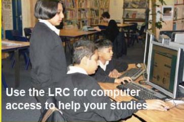
Use the LRC for computer access to help your studies