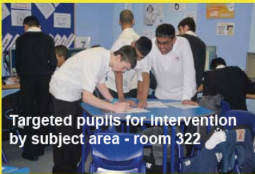
Targeted pupils for intervention by subject area - room 322

Open to all Year 10, Year 11 and 6th form